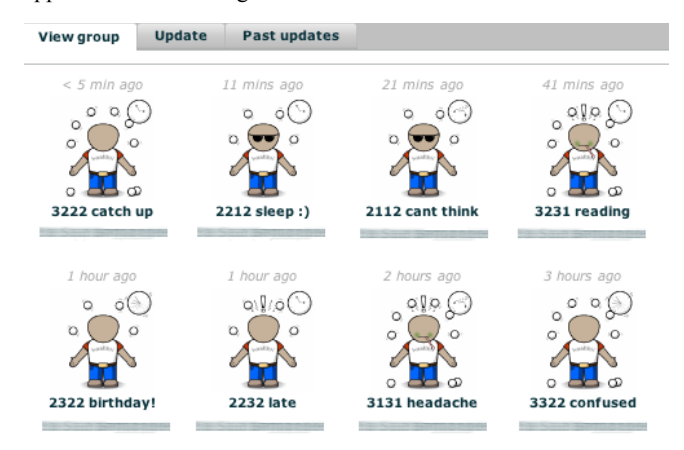
Figure 3. An example of a group view of participants, showing both numeric and avatar view, ordered by last update. (names redacted)

One's followers on Twitter would see updates, and the Facebook application would reflect the Twitter update. The Healthii bot also re-tweeted when a participant updated from the Facebook application to encourage awareness.