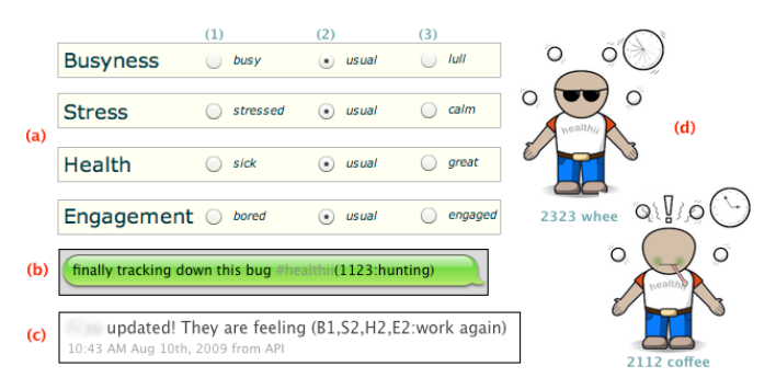
Figure 1. Well-being input and output examples using Healthii tool (first iteration). (a) Four input dimensions. (b) Text update via Twitter. (c) Notification of update via Twitter. (d) Two examples of state with avatar and numeric description.

iConference 2011 , February 8-11, 2011, Seattle, WA, USA Copyright © 2011 ACM 978-1-4503-0121-3/11/02...$10.00